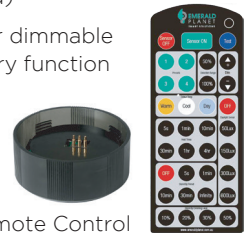
Sensor and Sensor Remote Control